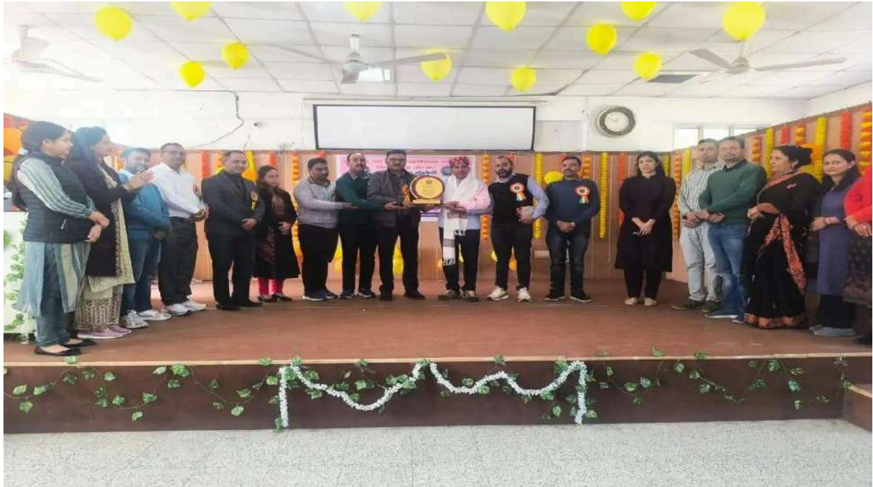
A one-day history symposium was organized by the History Department at Govt. College Jaisinghpur on November 12, 2025. Its main theme was "A Reflection on the 1857 Revolution."