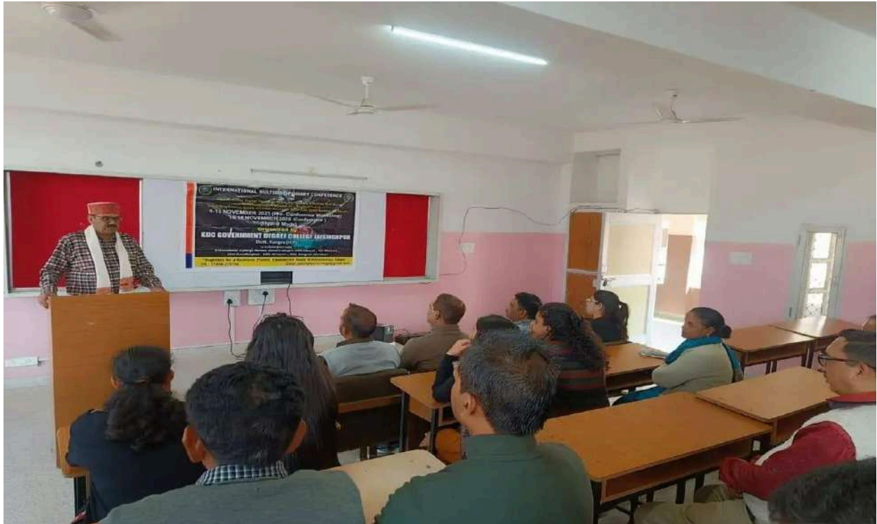
The international conference was inaugurated at Jaisinghpur College on November 16, 2025. It was titled "Sustainability, Digital Transformation, Democracy and Human Wellbeing: A Multidisciplinary Path to a Reliable Future."