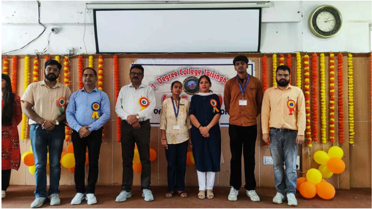
On 8-Oct-2025 an Oath-taking ceremony of the Central Student Council (CSCA) was organized for the session 2025-26.