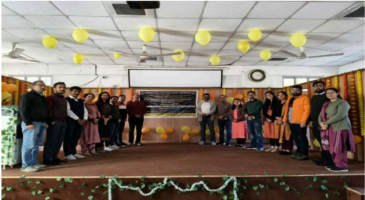
Pre-Conference Workshop was organised as part of an upcoming conference in Kanwar Durga Chand Govt. College Jaisinghpur, to be held from 9-15 November,2025 in association with Rise Himalayan.