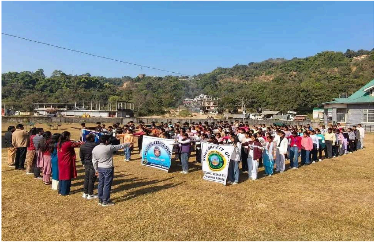
The National Service Scheme (NSS) Unit of Kanwar Durga Chand Government College Jaisinghpur, celebrated Constitution Day on 26 November 2025. A mass reading of the Preamble and a swearing-in ceremony were held on the college campus.