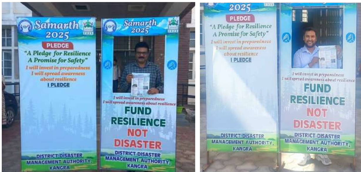
One day Disaster awareness and oath taking program was organized by District Disaster Management Authority Kangra under "Samarth 2025" at Kanwar Durga Chand College Jaisinghpur .