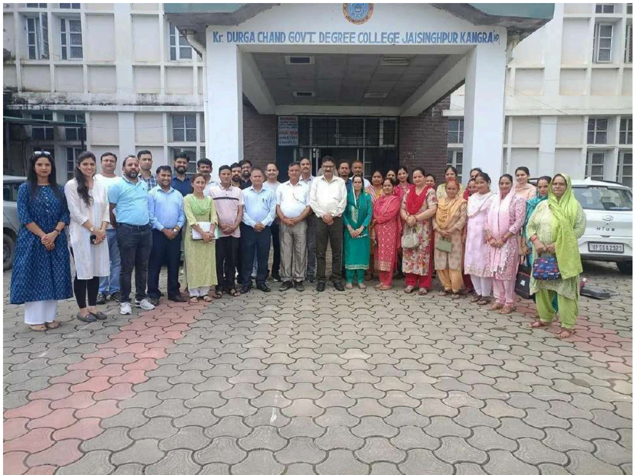
A meeting of the Parent-Teacher Association (PTA) was organized on Sept 13, 2025.