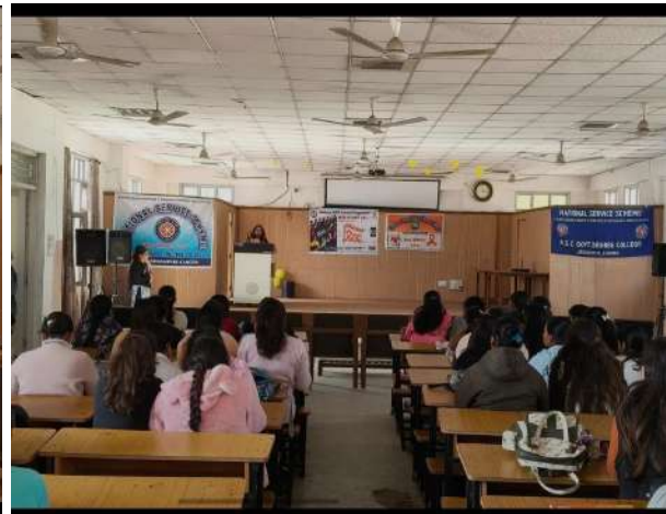
An awareness lecture was organised by the Red Ribbon club on the occasion of World Aids Day. The aim of this lecture was to simplify and prioritize access to HIV prevention, testing and treatment.