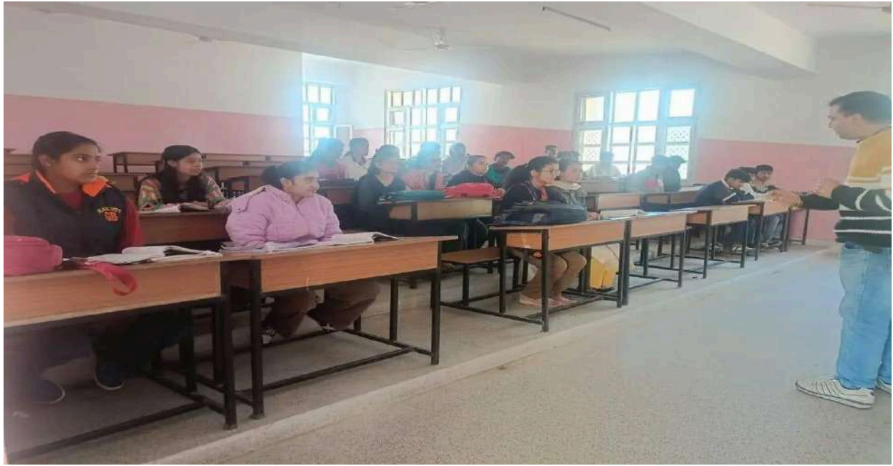
A lecture was organised by ELC (Electoral Literacy Club) under the voter awareness campaign on 15th November at Government College Jaisinghpur.