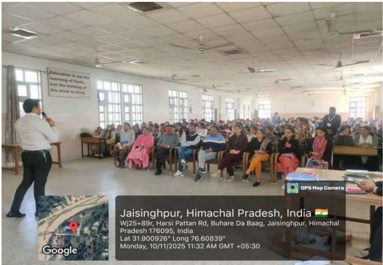
Seminar was organized today on 10-Nov-2025 under the joint efforts of College Career Counseling Cell and Crack Academy at Kanwar Durga Chand State College Jaisinghpur.