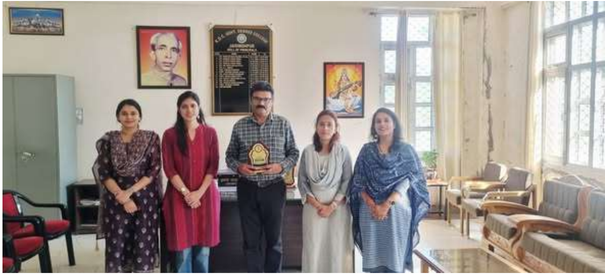
Kanwar Durga Chand College Jaisinghpur's Red Ribbon Club achieved district level honor in 'Nikshay Mitra' campaign.