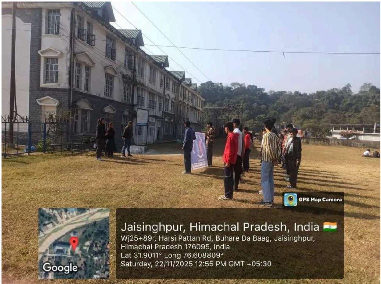
Jaisinghpur College celebrated NCC Day on 24 November, 2025. On this occasion, the college's NCC cadets paraded together and sang the national anthem.