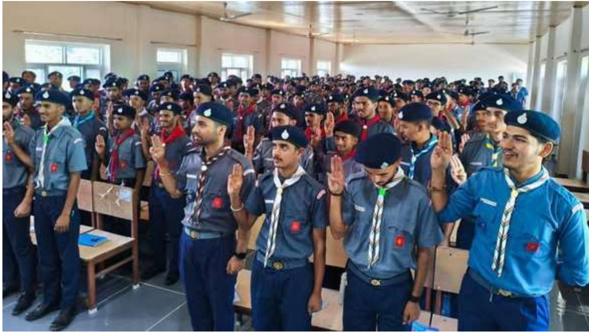
Certificates distributed to four Rovers by Rovers and Rangers Unit at Kanwar Durga Chand State College Jaisinghpur on 6 November 2025.